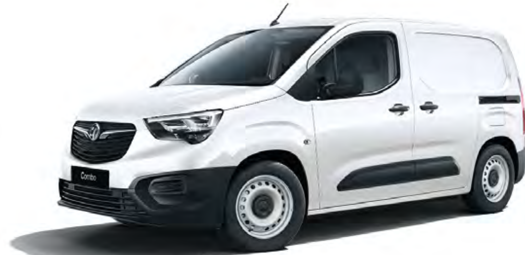
Jade White (G20)* Solid paint